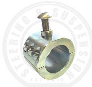
FOX ATS VERSION