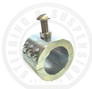
FOX ATS VERSION