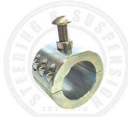
FOX ATS VERSION