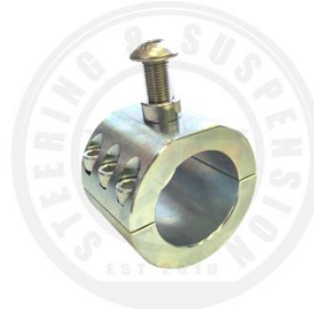
FOX ATS VERSION