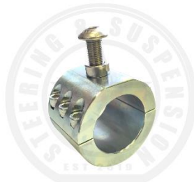
FOX ATS VERSION